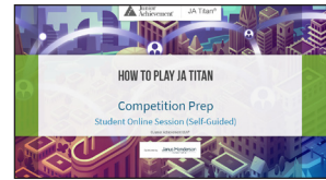
Student Online Session: How to Play JA Titan